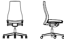
VIDEN SWIVEL CHAIR HB UPH PRO