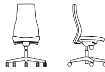
VIDEN SWIVEL CHAIR HB UPH